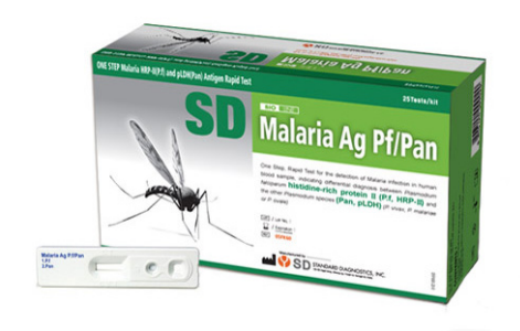
Malaria P.falciparum + Pan rapid test SD Bioline Ag