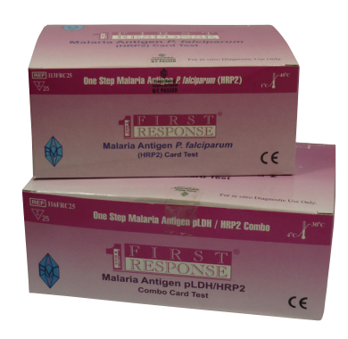
Malaria P.falciparum + Pan rapid test First Response Ag / Malaria P.falciparum rapid test First Response Ag