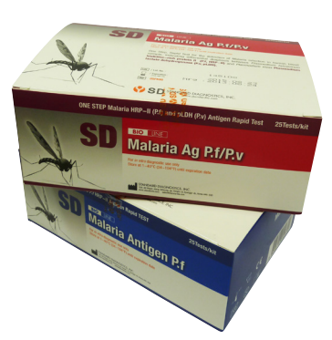
Malaria P.falciparum + P.vivax rapid test SD Bioline Ag / Malaria P.falciparum rapid test SD Bioline Ag