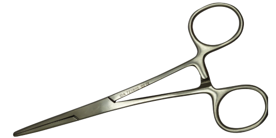
Forceps artery Pean