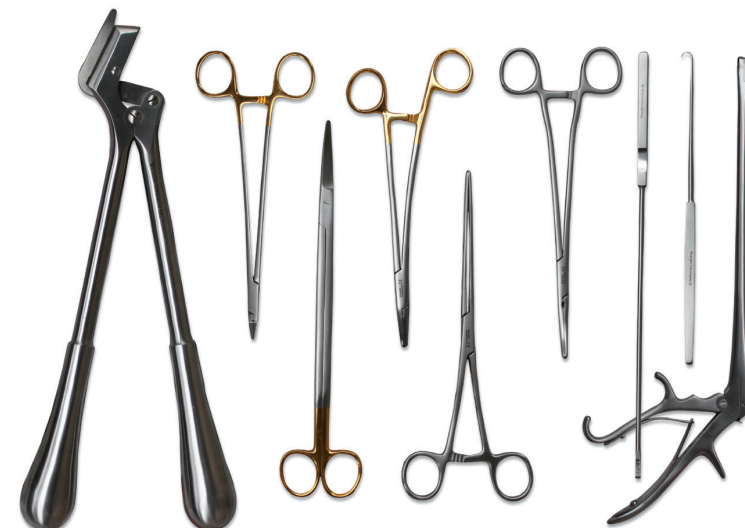
Mix of surgical instruments

According to the type of instrument and how it is used the instrument get a heat treatment to give the required elasticity or hardness. The instruments have polished mirror finish to prevent rusting.