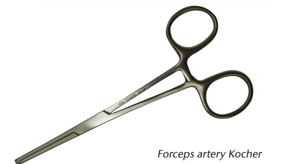
Forceps artery Kocher