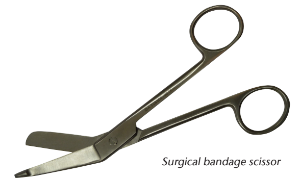
Surgical bandage scissor