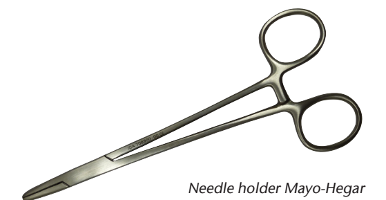
Needle holder Mayo-Hegar