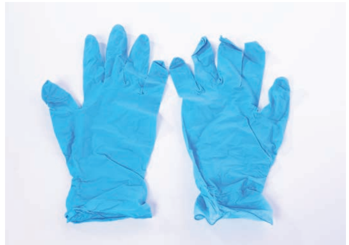
Nitrile examination gloves G304-G13-01