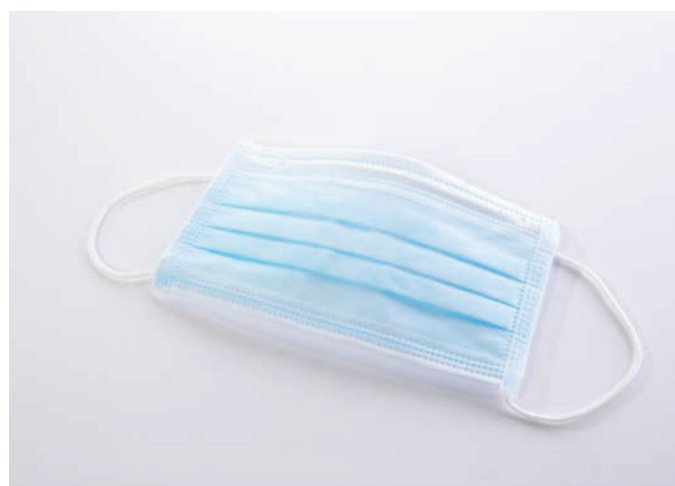
Medical face mask IIR 8913-TY3-17