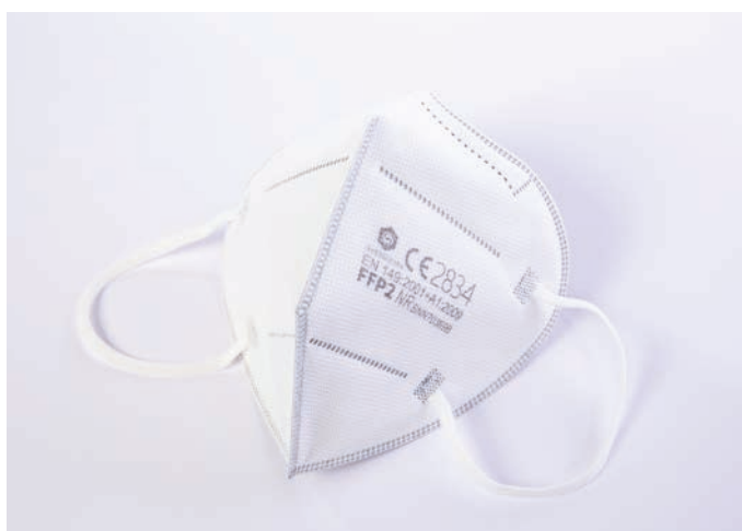
Face mask FFP2 R501-002-D9