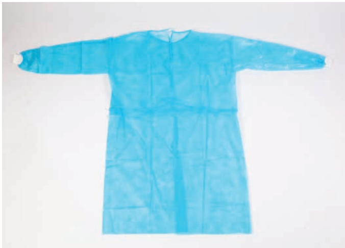
Isolation gown Z198-TY5-01