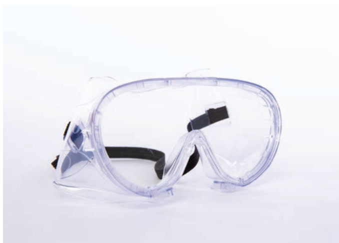
Goggles protective Z215-TY2-F4