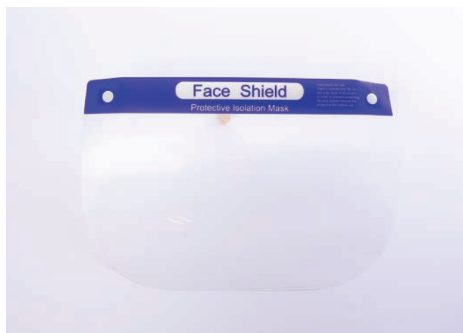
Face shield Z213-TY3-83