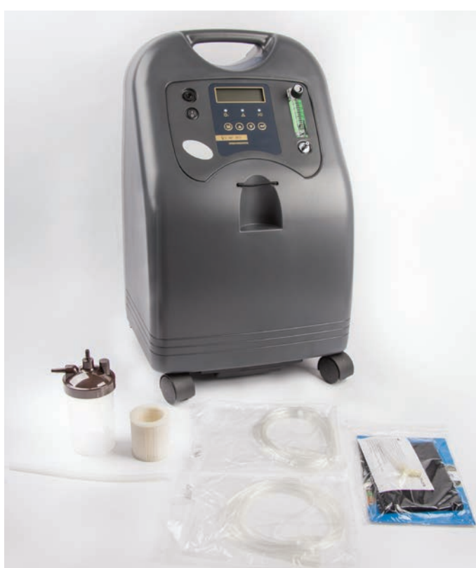
Oxygen concentrator E788-TY1-00