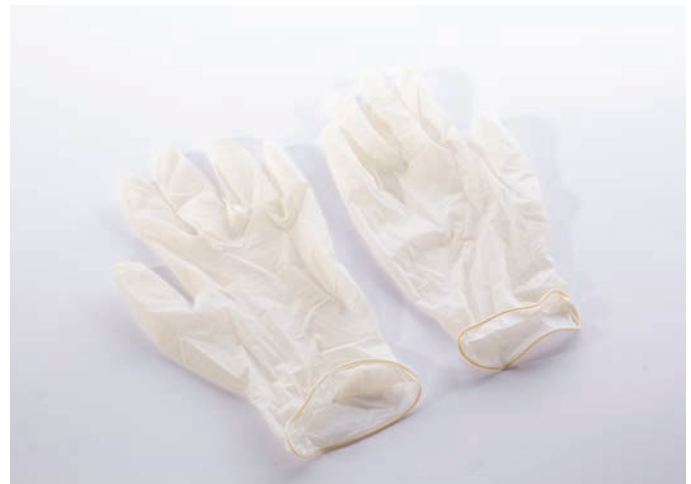
Latex examination gloves G301-G13-01