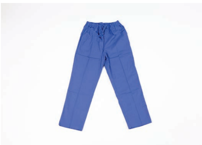
Scrub suit (top + pants) Z238-TY3-00