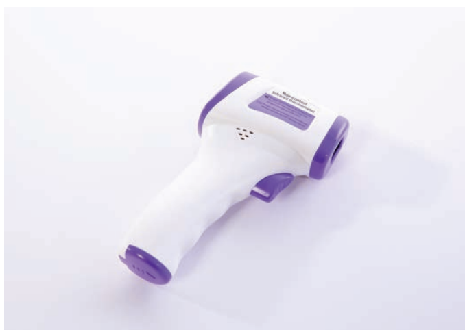
Thermometer infrared 8510-TY3-00