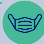
SURGICAL FACE MASK / RESPIRATOR KN95

Eye protection for healthcare professionals against blood splash and pathogens. Should be worn in settings where aerosols (solid and liquid) may be generated. Re-usable.