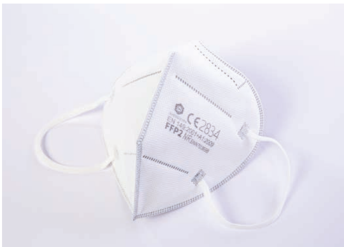
Face mask FFP2 R501-002-D9