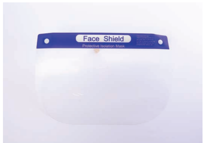
Face shield Z213-TY3-83